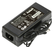
28V 2.57A adapter (PoE version)