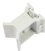
Pole mount bracket